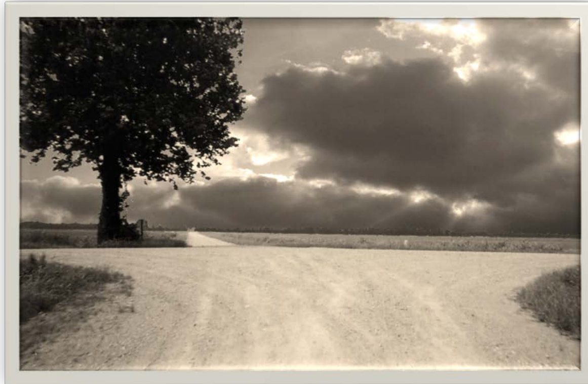
Coahoma County, Mississippi Former Intersection of U.S. 61 and U.S. 49