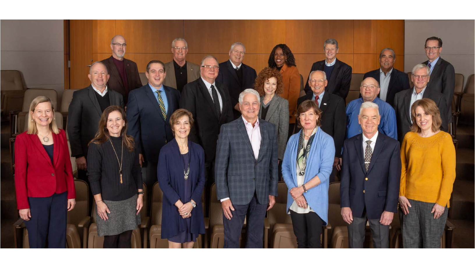
Farm Foundation Board of Directors