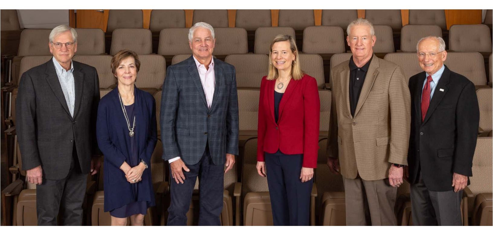
Legge Lowden Farm Foundation Board of Trustees