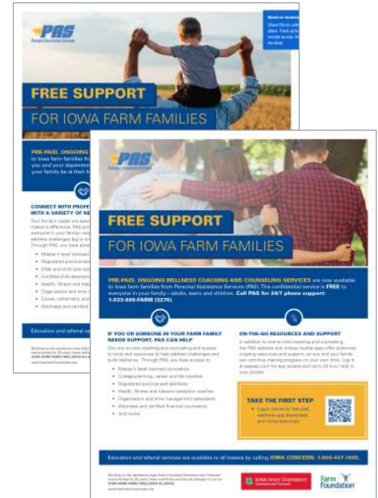
Flyers: general and student versions