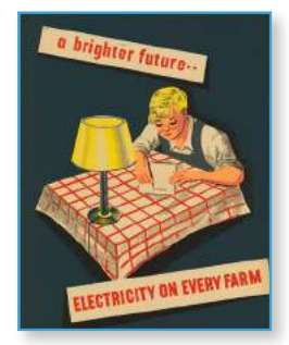
Rural Electrification Act changes rural life

December 6, 1933 Creation of Farm Foundation is announced