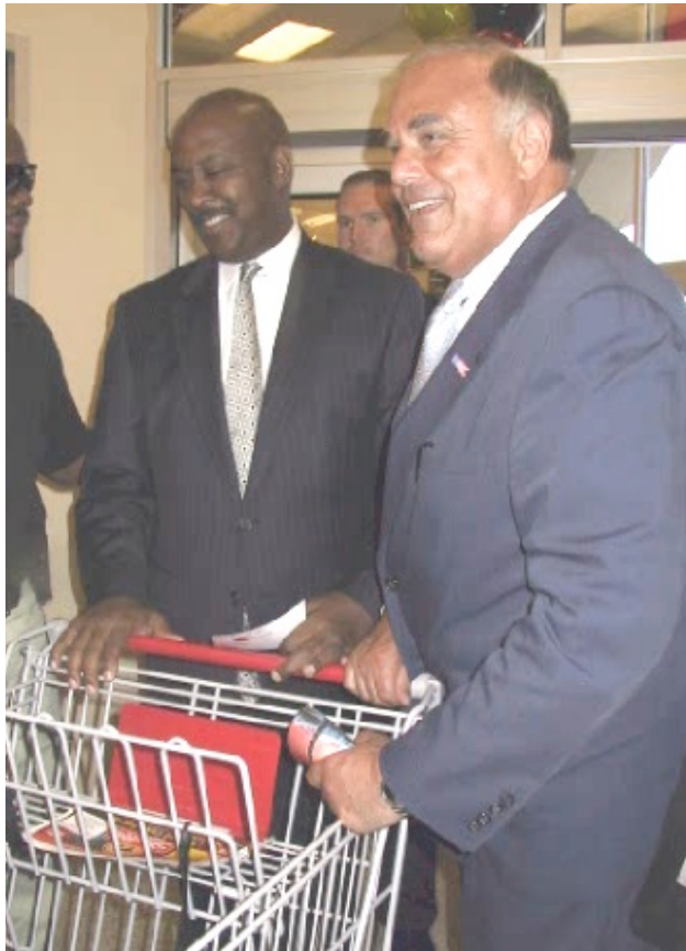
Governor Rendell and Representative Evans at the opening of the FFFI-financed Shop Rite in Philadelphia.